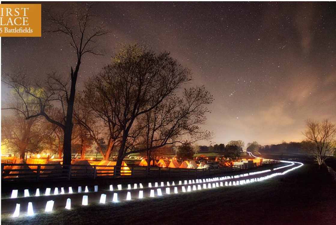
150 th Appomattox Courthouse event