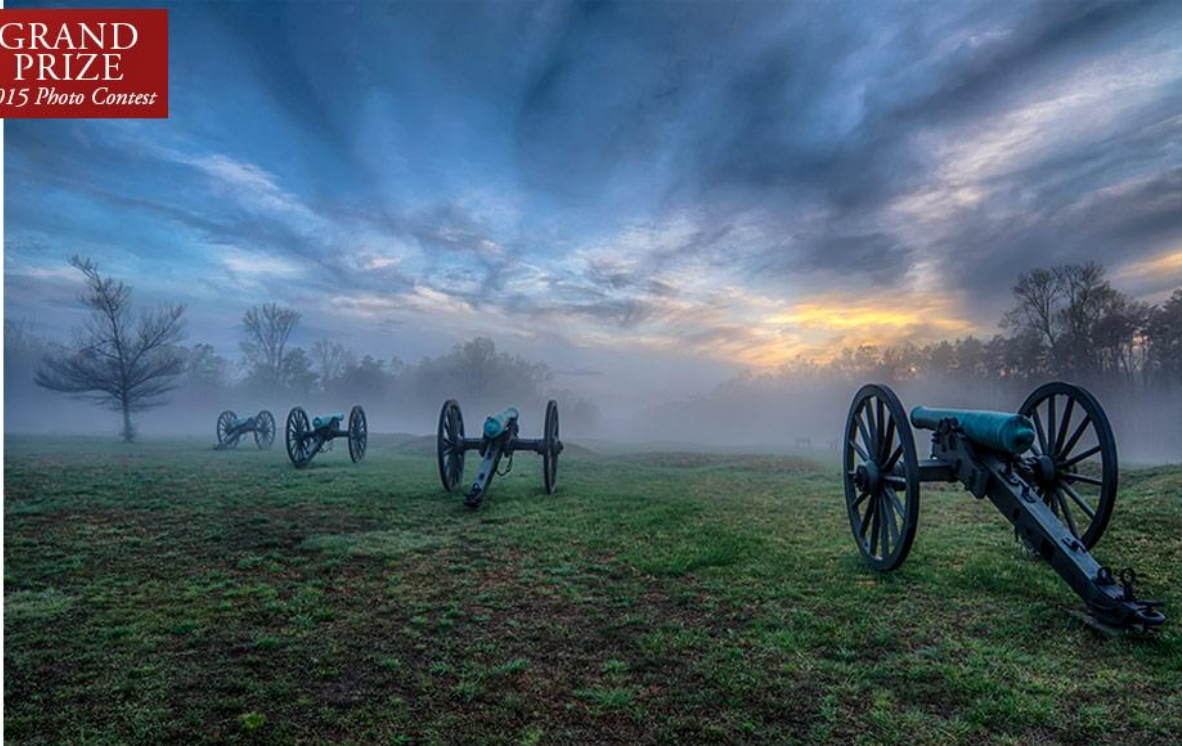
Early morning at Chancellorsville