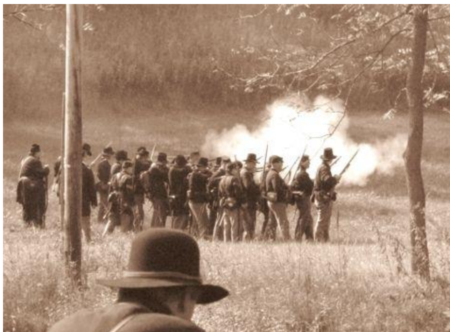
Lyle Laufenberg photo of the infantry as they engage the rebels in battle