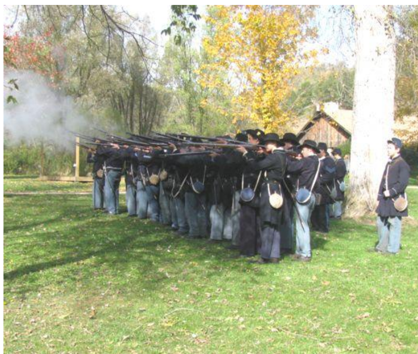
Firing drill by Union troops