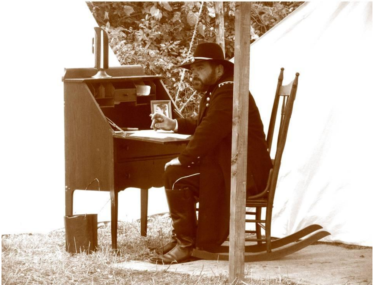
General Grant at Old Wade House event

The members of Company B would like to extend to their comrades from the other Companies in the Association who attended their event at Norskedalen in October their sincerest gratitude. They want to thank everyone who attended for their participation in the event and their contributions to make it a successful weekend.