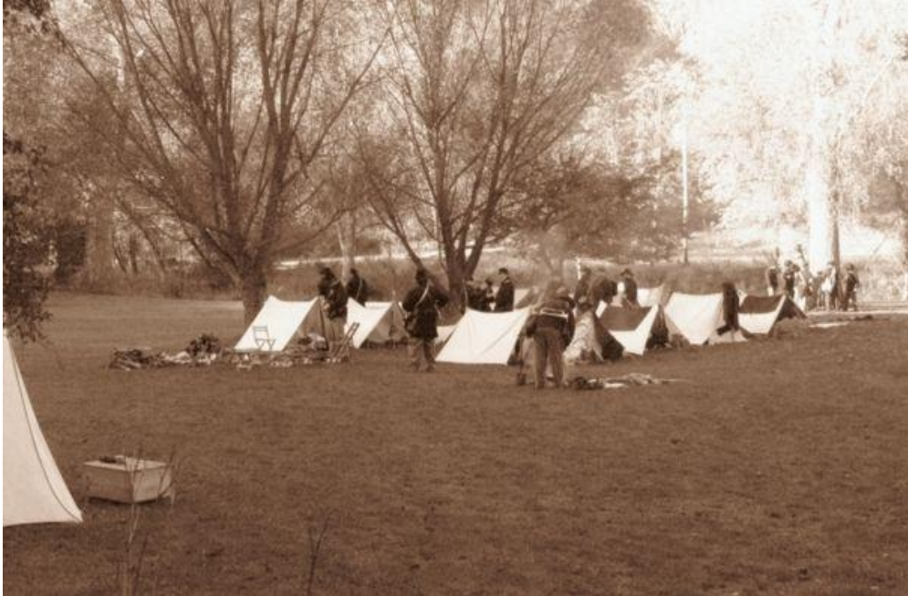
Union encampment at Norskedalen