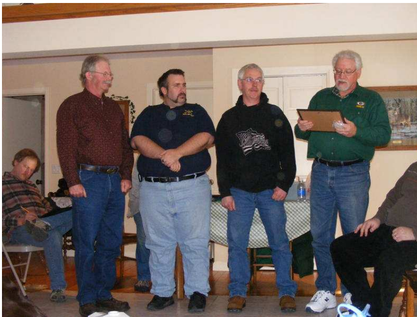
Figure 2 OTHER AWARDS HANDED OUT BY CAPT. DOTY