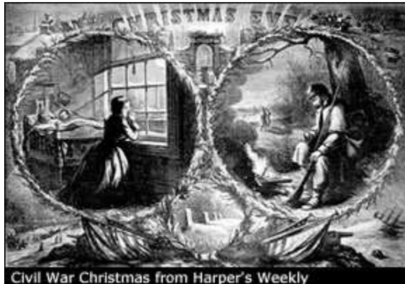
Civil War Christmas from Harper's Weekly