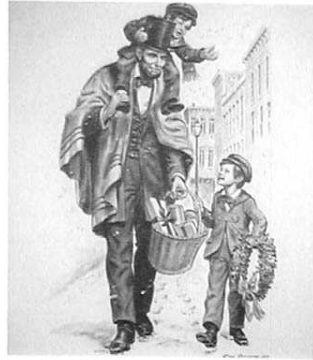
ABE LINCOLN CARRIES TAD PIQUETTE BACK WHILE WILLIE CARRIES THE CHRISTMAS WREATH, SPRINGFIELD, ILLINOIS 1860.