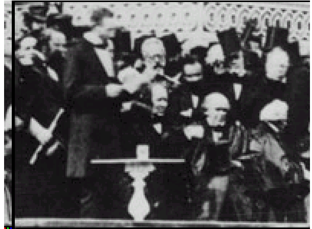
Figure 13 Lincoln reads the superlative effort known as his Second Inaugural speech.