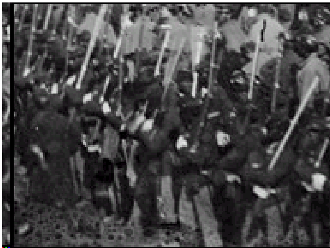
Figure 14 Union soldiers in full dress uniform provide a barrier between the crowd and the Capitol building—also note the African-American troops behind the line of soldiers.