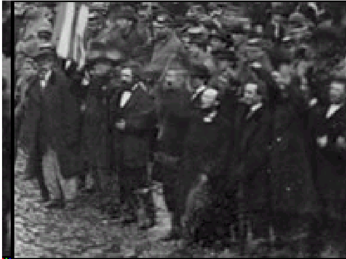
Figure 15 The crowd looks to the Capitol steps where Lincoln will address the crowd.